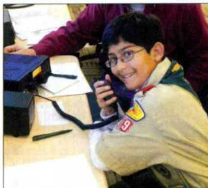
Figure 1 — Jamboree-on-the-Air is the largest Scouting event in the world, with nearly 750,000 Scouts participating from more than 6000 stations across 150 countries. Here is a Scout on the air from K2TD during the 2012 Jamboree-on-the-Air. Equipment was obtained through the Icom America equipment loan program.

K2BSA has been in action at every national Scout Jamboree since 1977. However, Amateur Radio has been present since at